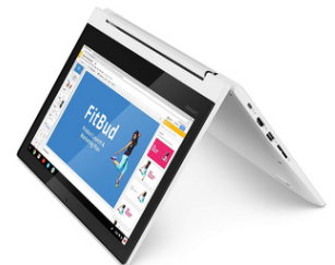
Lenovo Chromebook (11 in.) 325 Points

Important Notes: AYA purchases items from preferred vendors only. Please allow approximately two weeks to process. AYA may not be able to meet LC requests for specific delivery dates. All orders for end-of-year must be received by 12/1. Please order in advance to allow for possible, unforeseen delivery and processing delays. Shipping and delivery times may vary according to vendor and availability and may be subject to change. Gold Standard Rewards cannot be used to redeem cash or gift cards.