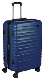
Amazon Basics Luggage (26 in.) 75 Points