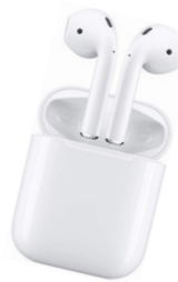
Apple AirPods with Charging Case 175 Points